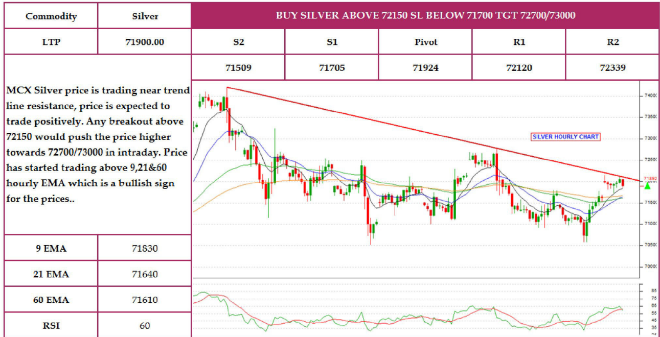
Chart of the days